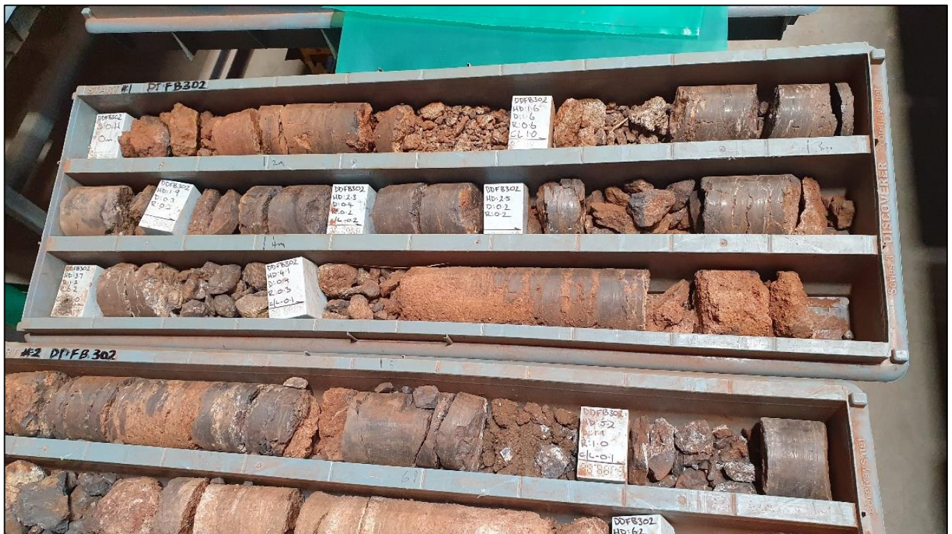
Figure 2. PQ core from the FB3 deposit showing zones of manganese enrichment and interstitial clays and weathered shales from surface to 5m depth from diamond core hole DDFB302

The drill core has been examined and composited into an LR1 upper, LR1 lower, FB3 and FB3 lower grade domains to examine variability in mineralisation style and grade across the various orebodies. The program of work planned includes comminution, scrubbing/screening, benchtop dense media assessments using heavy liquid separation and mineralogy. An area of focus is understanding the intensity of scrubbing and washing which from past testwork was able to significantly and cheaply upgrade manganese content with the removal of clay/shale and some of the iron oxides. The high grade nature of the outcropping Flanagan Bore deposits supports a higher feed-grade which can be significantly upgraded with simple scrubbing and washing. This is a cost effective means of removing barren mass allowing density separation techniques to provide the final beneficiated grade increase.