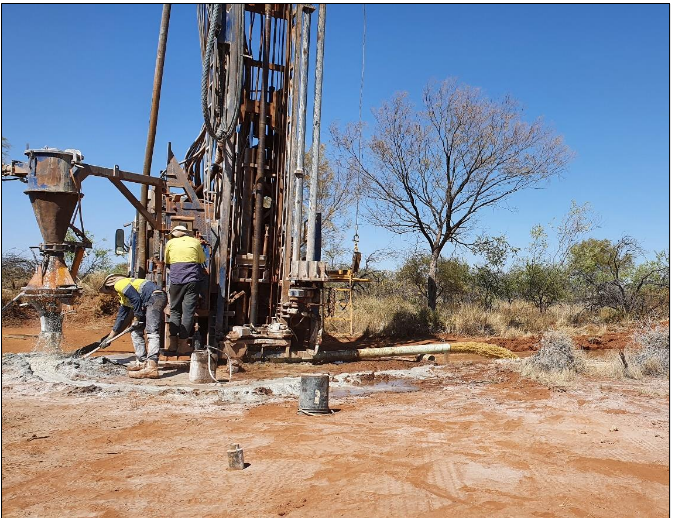
Figure 3. Drill rig air lifting an exploration hole that encountered water at Flanagan Bore.

Based on the encouraging results to date further hydrological drilling will be undertaken to delineate the aquifer potential of the carbonate units that will enable modelling to understand recharge and long term sustainability of supply.