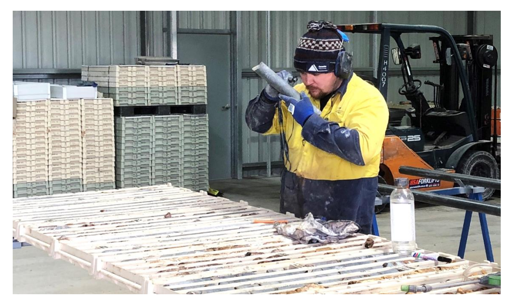
Figure 1: Examining drill core from Hill 800.

"It's great to follow-up last week's outstanding results at Hill 800 with the completion of the earn-in deal. We now have 100% of the Jamieson project, where the Hill 800 exploration program is in full swing with two drill rigs and a geophysical crew on-site. We look forward to announcing further drill results as they are received over the next two months."