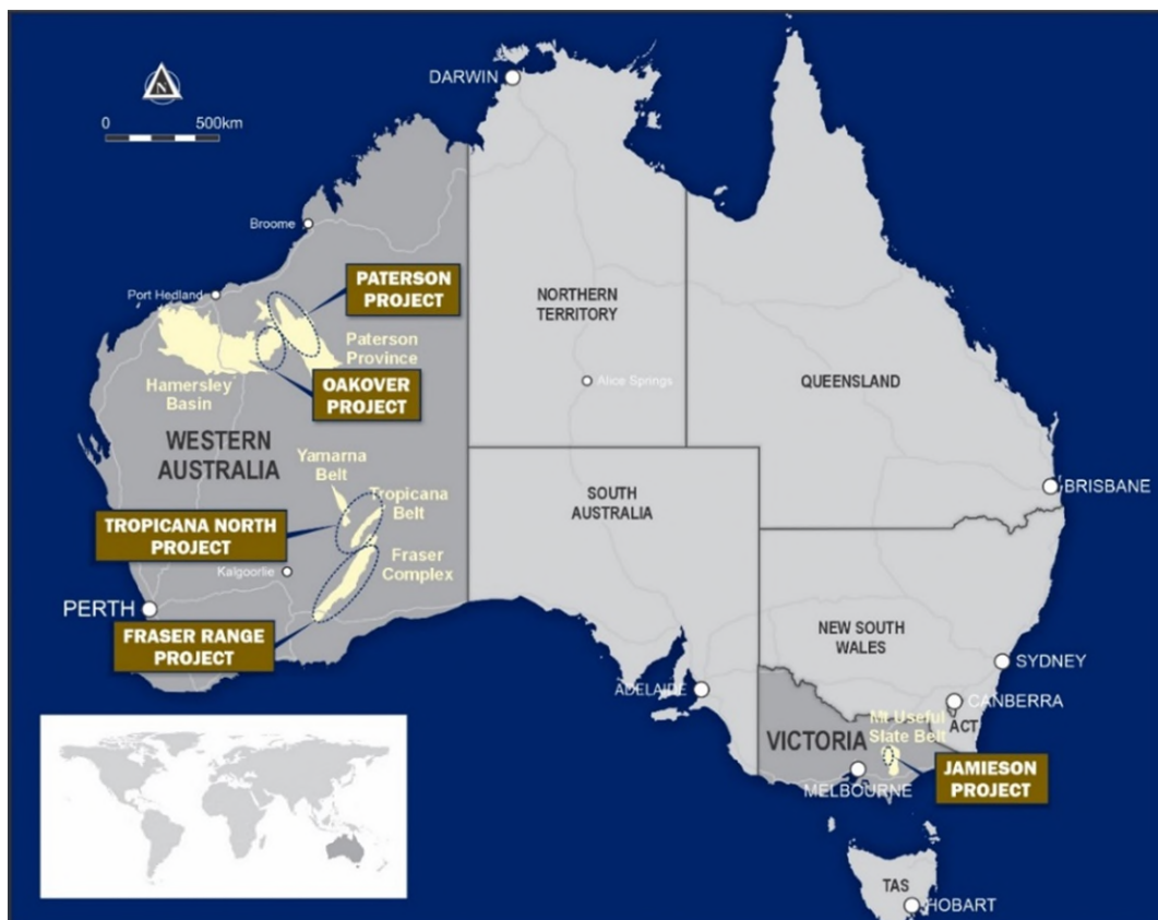
Figure 1: Location of Carawine's Projects throughout Australia.

The Company has five gold, copper and base metal exploration projects, targeting high value deposits in highly prospective, active mineral provinces in Western Australia and Victoria (Figure 1). Part of Carawine's assets located in Western Australia are held by its wholly owned subsidiary, Phantom Resources Pty Ltd.